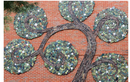
Sketch by Silvina Mizrahi